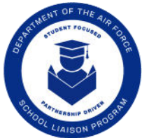
School Liaison Program