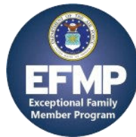
EFMP Family Support